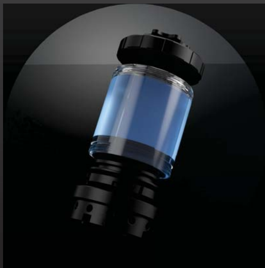
Match exactly without water leakage

After thousands of tests, the CHASING water sampler achieves no water leakage during operation, fully ensuring the safety of samples in the target waters and the accuracy of the detection report.