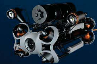
Precise hovering and sampling at a fixed point